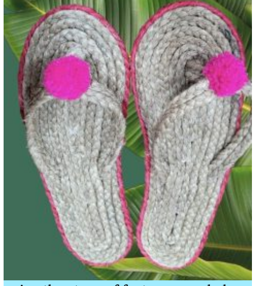
Another type of footwear made by making use of fibers of banana tree stem

Emphasizing the strength, flexibility, and biodegradable properties of banana fibers, discussion on the R&D of creating innovative footwear, accessories, and garment designs using banana fibers was also done by the technical experts of FDDI. The discussion also covered the various techniques for processing banana fibers and integrating them into contemporary fashion designs.