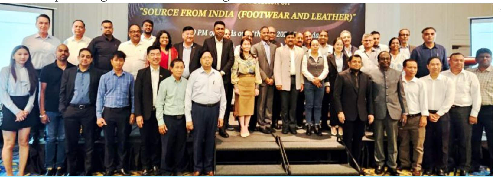
Delegation attending the interactive session - 'Source From India (Footwear and Leather)'

The team's visit facilitated significant n e t w o r k i n g opportunities that could contribute to the growth and development of the footwear, leather, components and a c c e s s o r i e s manufacturers, and design industries.