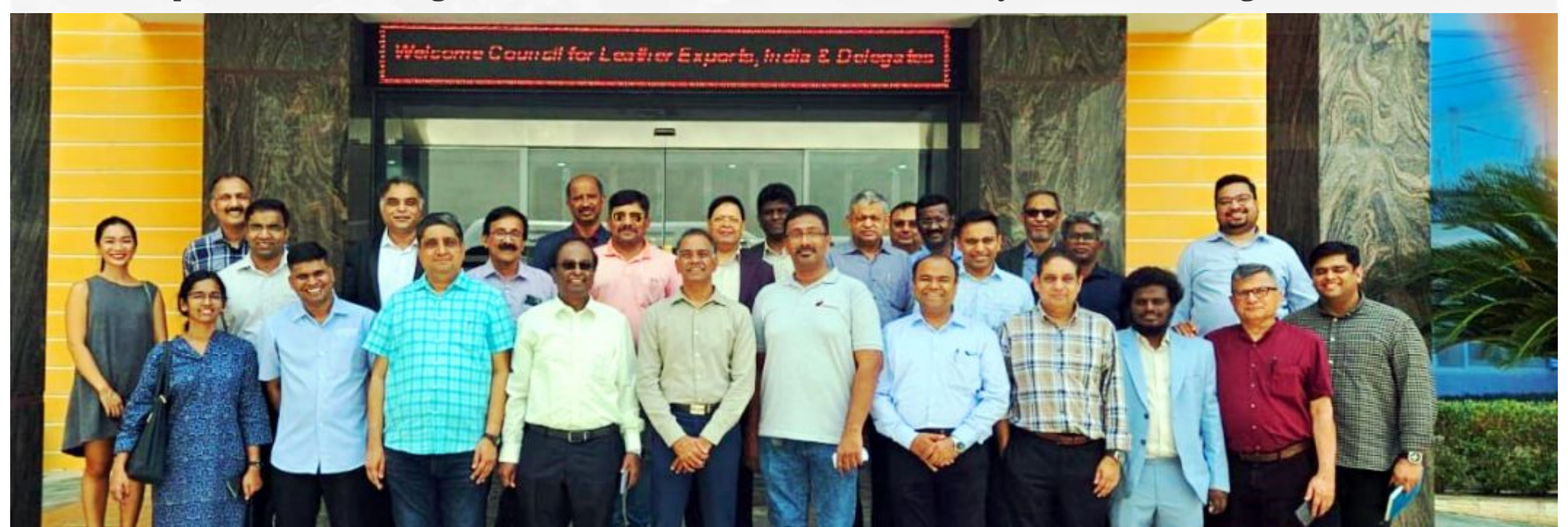
DPIIT, FDDI and CLE delegates, along with Thanh Khon Co Ltd., industry representatives

systems and technology in shoe design, leather goods, and production equipment from the fair which is one of the most important and leading events for the shoes and leather industry in the ASEAN regions.