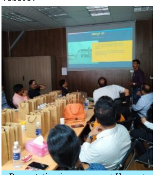
Presentation in progress at Harvest Glory Limited

For gaining market insights, and adopting advanced technologies and sustainable practices, the delegation also visited some companies located in Vietnam. MD-FDDI presented a brief introduction to FDDI during these visits