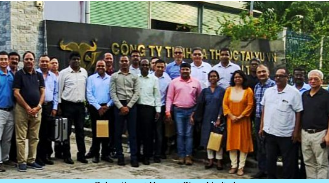
Delegation at Harvest Glory Limited

Collaboration opportunities were explored with Thanh Khon Co Ltd., focusing on innovative product development and sustainable manufacturing techniques. This partnership aimed to leverage the strengths of both organizations to create advanced and eco-friendly footwear solutions.