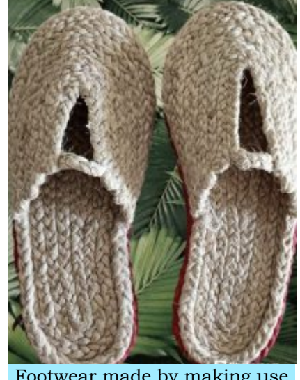
Footwear made by making use of fibers of banana tree stem

and Enterprise Development Programmes (LEDP) under National Board for Agriculture and Ruler Development (NABARD), visited FDDI, Fursatganj campus.