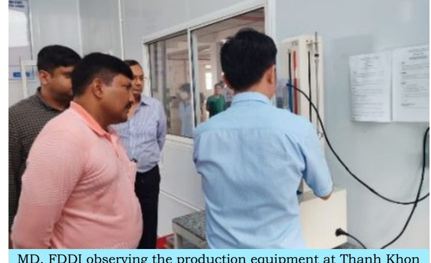
MD, FDDI observing the production equipment at Thanh Khon Co Ltd., Vietnam