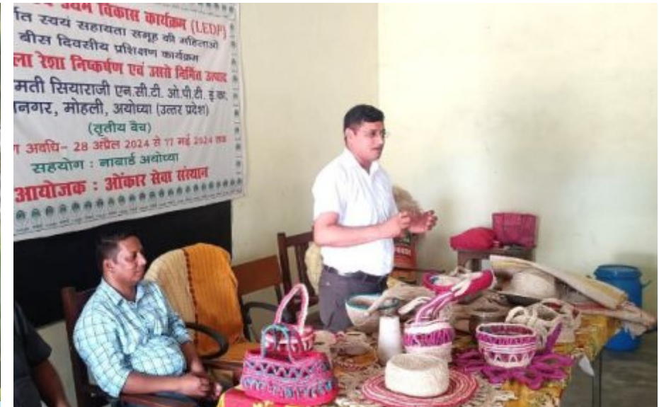
Technical experts of FDDI briefing the artisans on the skill upgradation training programme