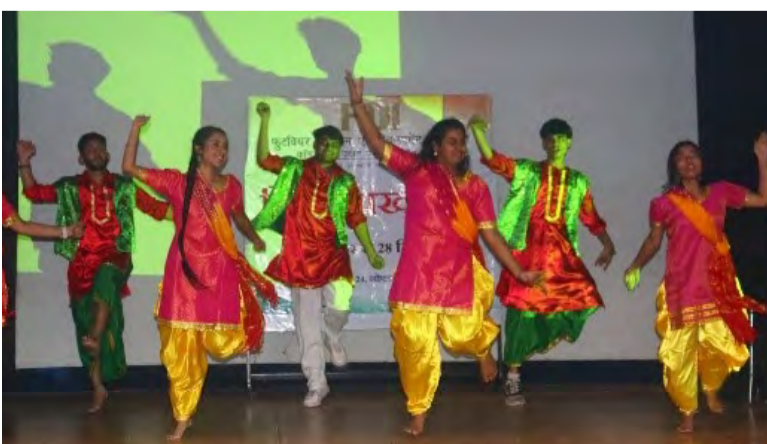
A view of cultural program at FDDI, Noida campus