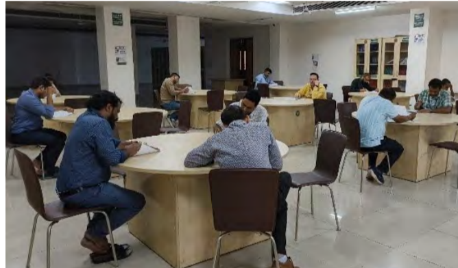
A view of competition at FDDI, Hyderabad campus