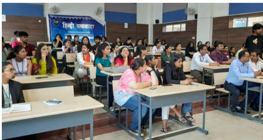
Officers / Employees participating in competition at FDDI, Noida campus

'Hindi Pakhwara' (Hindi Fortnight) was held at all the campuses of FDDI from 14-28, September, 2024.