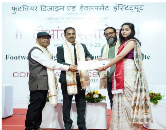
A graduating student receiving Degree during the Convocation ceremony of FDDI, Chhindwara

The Convocation ceremony for the graduating batch of 2019-2023 of FDDI, Chhindwara campus was held on 4 th October 2024.