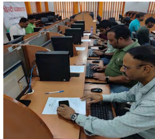
Officers / Employees participating in competition at FDDI, Noida campus

In order to promote the knowledge and skills in use of official language – Hindi among the faculty, staff and the students in consonance with the policy of Government of India, four competitions were organized during the 'Hindi Pakhwara'.