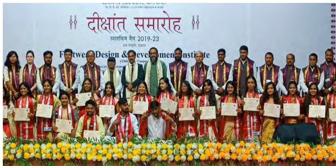
A view of the passing-out batch of FDDI, Chhindwara campus