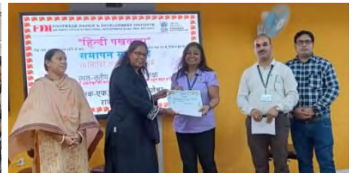
A winner receiving the prize at FDDI, Ankleshwar campus