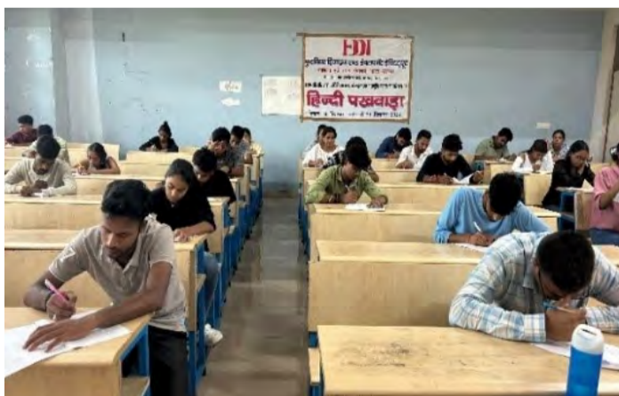
Competition in progress at FDDI, Patna campus

In order to promote the knowledge and skills in use of official language – Hindi among the faculty, staff and the students in consonance with the policy of Government of India, four competitions were organized during the 'Hindi Pakhwara'.