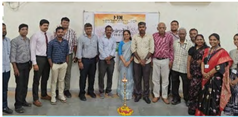
FDDI, Chennai campus

In her address, she emphasized that Hindi is our mother tongue and also our official language, hence it is essential for all of us to make a collective effort to promote it. The use of Hindi as the official language should be maximized in governmental work.