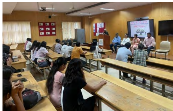
A view of competition at FDDI, Rohtak campus

The competitions witnessed the oratory, logical skills and the literary acumen of the faculty, staff and students in Hindi.