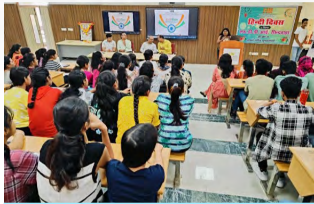
A view of 'Hindi Pakhwara' at FDDI, Chhindwara campus

Additionally, as per the directives of the Official Language Department, FDDI implemented the FDDI Official Language Promotion Scheme, under which academic and non-academic departments were