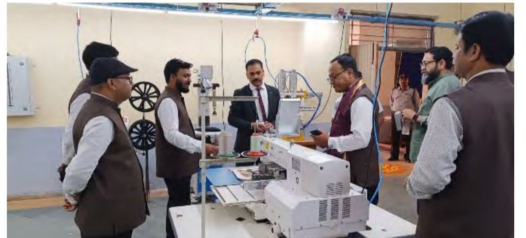
FDDI staff briefing about the facility to the dignitaries

This state-of-the-art lab represents a significant leap in merging modern technology with traditional craftsmanship, providing students with hands-on experience in the latest sustainable practices and advanced tools.