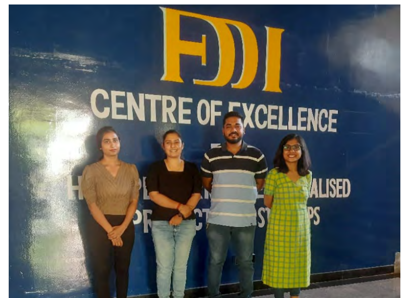
Team Start-up 'B FOR WOMEN' at CoE, FDDI, Jodhpur