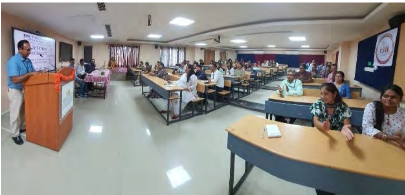
A view of 'Hindi Pakhwara' at FDDI, Jodhpur campus

inspected for their outstanding work in Hindi throughout the year and awarded with cash prizes and certificates.