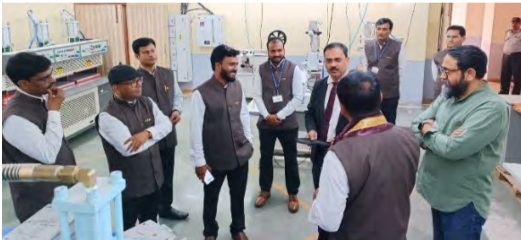
A view of the 'Non-Leather and Virtual 3D Modeling Lab'