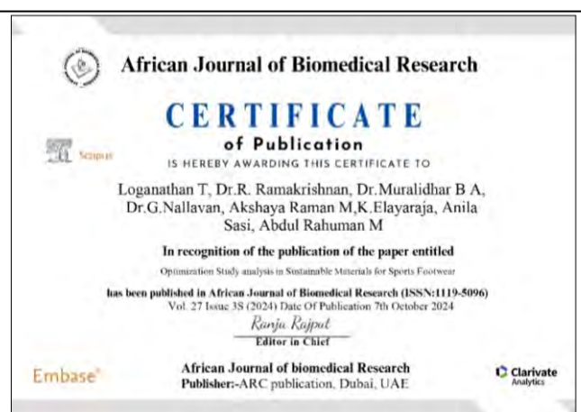
Certificate of Publication