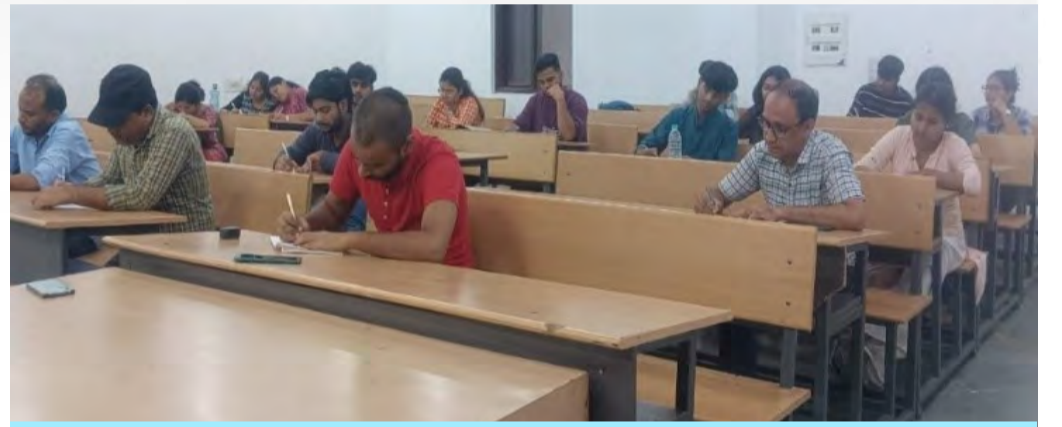
A view of competition at FDDI, Kolkata campus

inspected for their outstanding work in Hindi throughout the year and awarded with cash prizes and certificates.