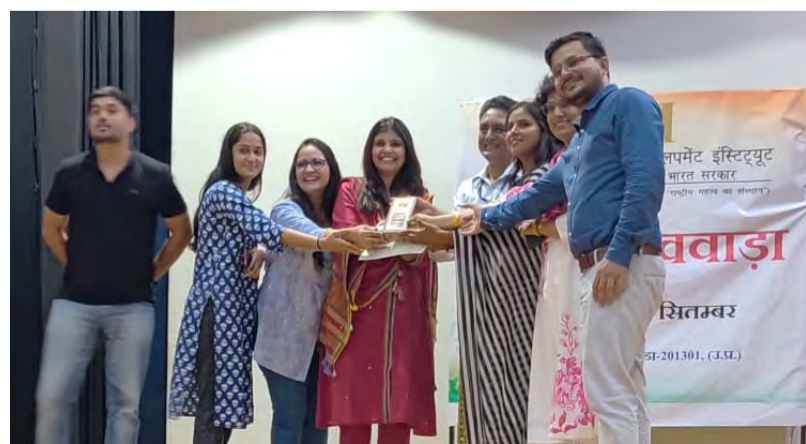
A view of the prize distribution ceremony at Noida campus

In this grand program, the students of the institute also presented cultural programs which was applauded by the audience. During the prize distribution ceremony, the winners were awarded cash prizes as well as certificate.