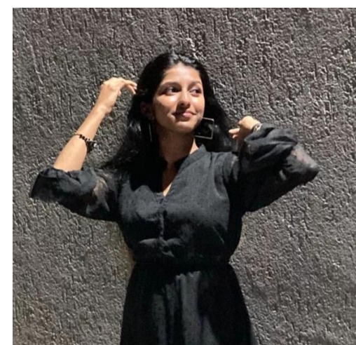
BY:ADITI KRISHNA / FD 22