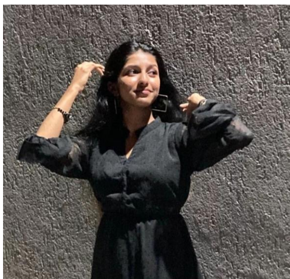
BY: ADITI KRISHNA / FD 22