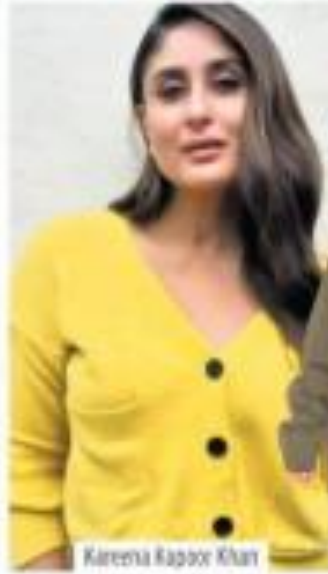
Kareena Kapoor Khan