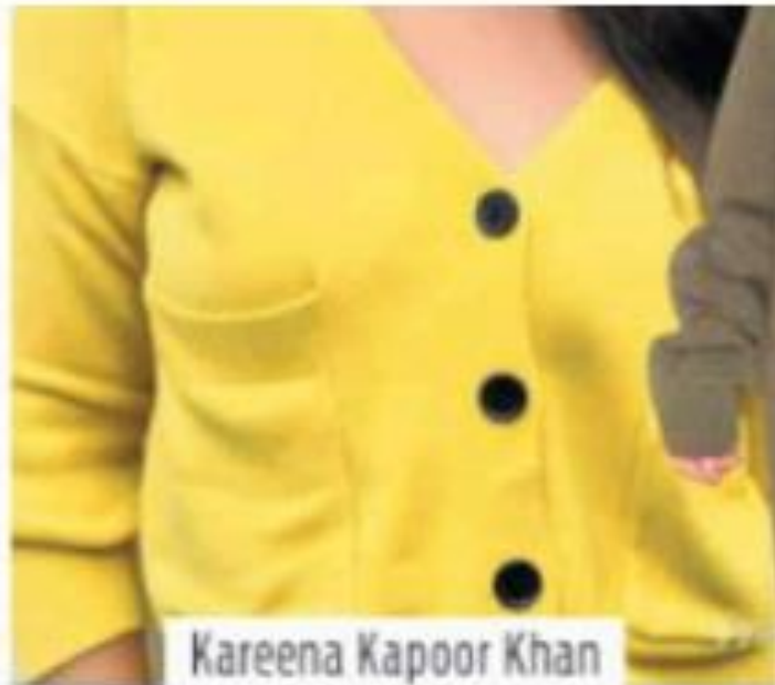
Kareena Kapoor Khan

e trend is all fort, there's ment of retro involved. hint of nostal- e trend but at time not for- at being com- s a key priori-